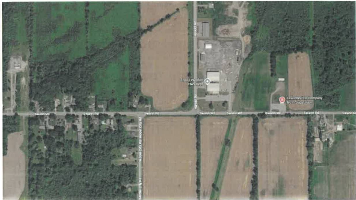
Intersections Location w/ Aerial